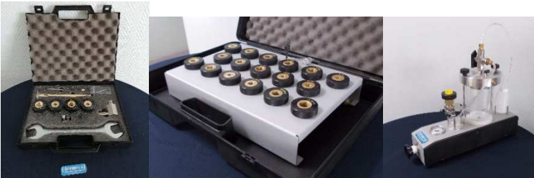
Ref OP0057 Accessories suitcase Ref OP0037 Suitcase with 17 adaptors type M + G + NPT + BSP-TR / Pressure max 1200 bar Ref OP0062 Cleaning bench

✓ Accessories (ask us our specific documentation)