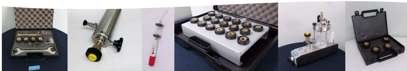
Ref OP0057 Accessories suitcase