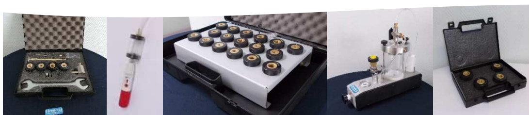
Ref OP0057 Accessories suitcase